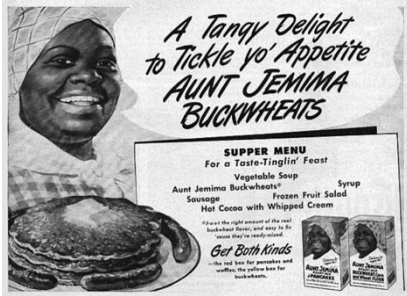
Aunt Jemima newspaper ad.