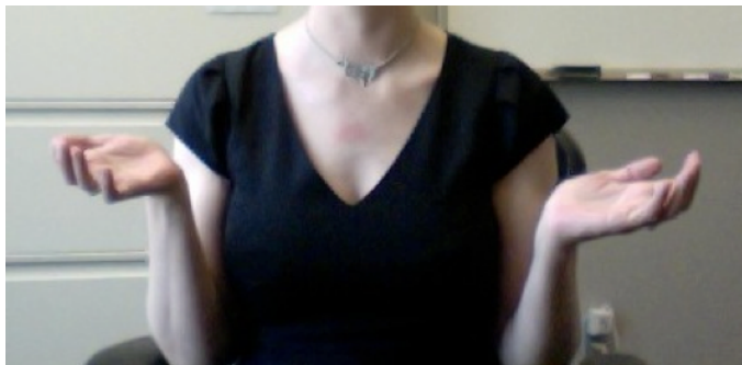
F. Hand shrug. Uncertainty.