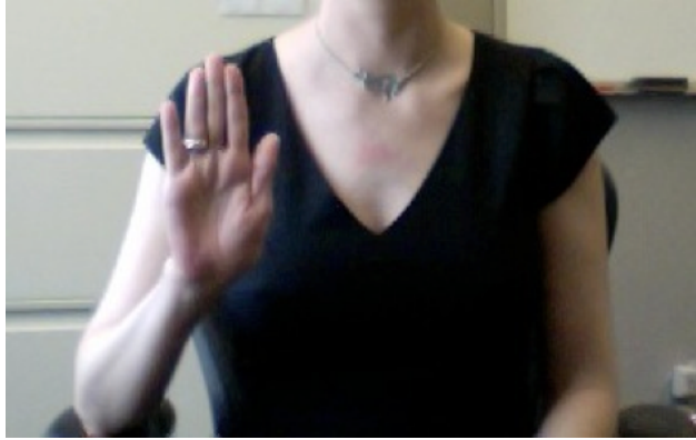
D. Stop. Used to hold turn. Often bounces a few times.