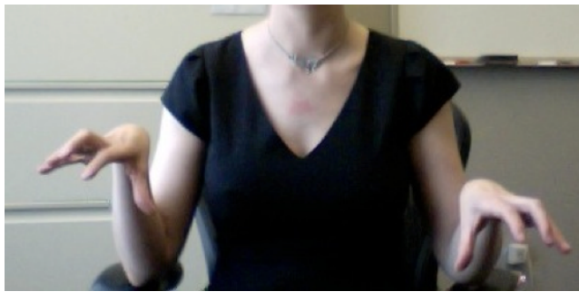
E. Contrast. Locating ideas in space. One hand comes down, holds, the other comes down. Each space associated with a concept (e.g., research and teaching).