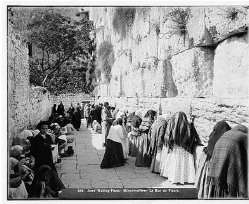
‘The Wailing Wall’

“Rav Acha said: The Divine Presence will never depart from the Kotel”