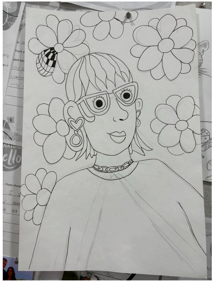
(In progress, I'm making it with them)

https://www.canva.com/design/DAGjT6kqj8k/yJ8GvA9ybOISusfTeaCRqw/edit?utm_content=DAGjT6kqj8k&utm_campaign=designshare&utm_medium=link2&utm_source=sharebutton