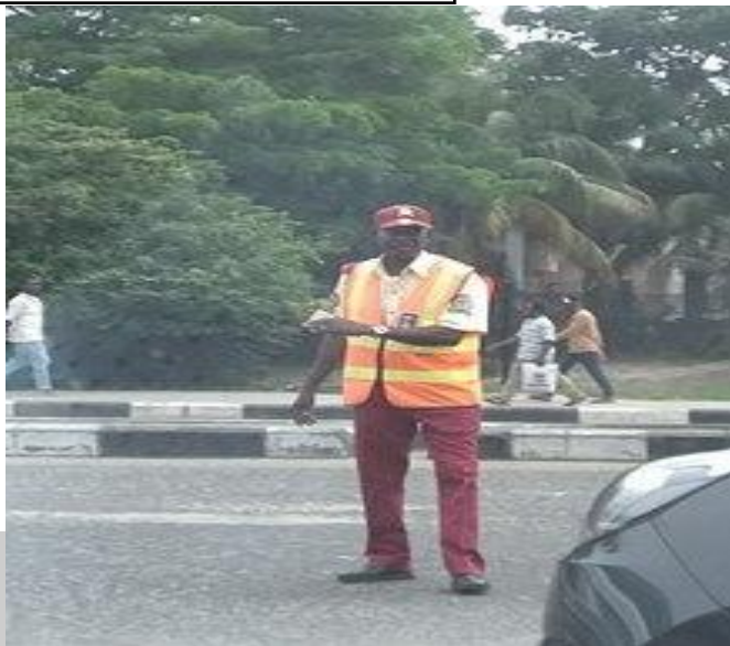
LASTMA official controlling traffic