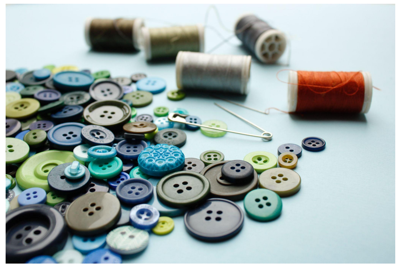
<alt="buttons, thread and sewing supplies">

Are you looking for an easy and eco-friendly way to update your wardrobe? <u>Coconut shell</u> <u>buttons</u> are a great option for those looking to give their wardrobe a unique and sustainable touch. Not only are coconut shell buttons stylish, but they are also natural, biodegradable, and affordable. In this blog post, we will explore 10 different ways you can use coconut shell buttons to update your wardrobe. From adding them to clothing items to making jewelry, the possibilities are endless. Read on to find out how to use coconut shell buttons to create stylish looks with a sustainability edge.