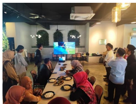
Figure 1. Group Discussion Forum