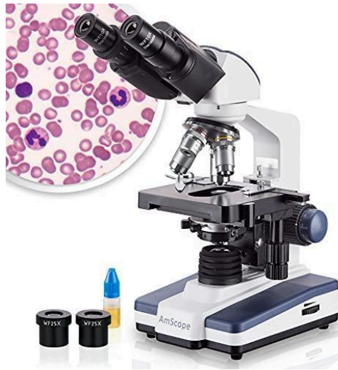
Figure 1. Example for research figure

reaches to the smallest value as \alpha=0.4 . Be considered to use tools of graphics design software such as an adobe illustrator, photoshop, etc.