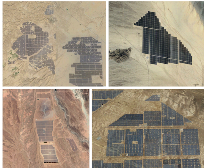
Clockwise from top left: Bhadla solar park, India; Desert Sunlight solar farm, U.S.; Hainanzhou solar park, China and Ouarzazate solar park, Morocco.

If these effects were only local, they might not matter in a sparsely populated and barren desert. But the scale of the installations that would be needed to make a dent in the world's fossil energy demand would be vast, covering thousands of square kilometers. Heat re-emitted from an area this size will be redistributed by the flow of air in the atmosphere, having regional and even global effects on the climate.