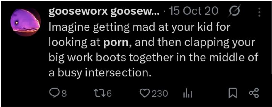
Figure 2: Gooseworx was also exposed for sending a minor suggestive art, and he knew it was a minor.