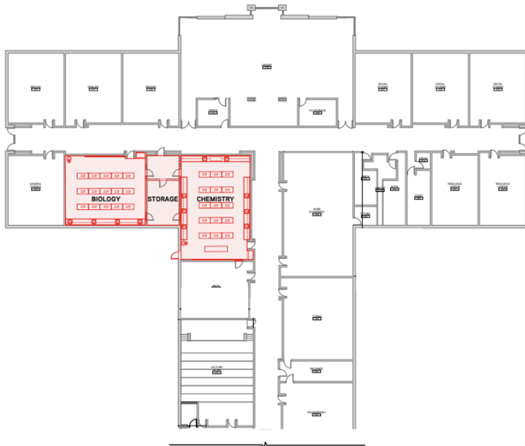
Partial High School Plan