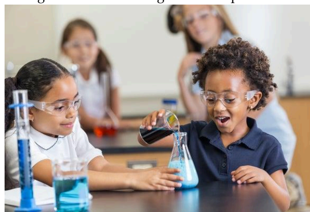
Figure 2. Attached figure in article

The figures must be arranged as example below: