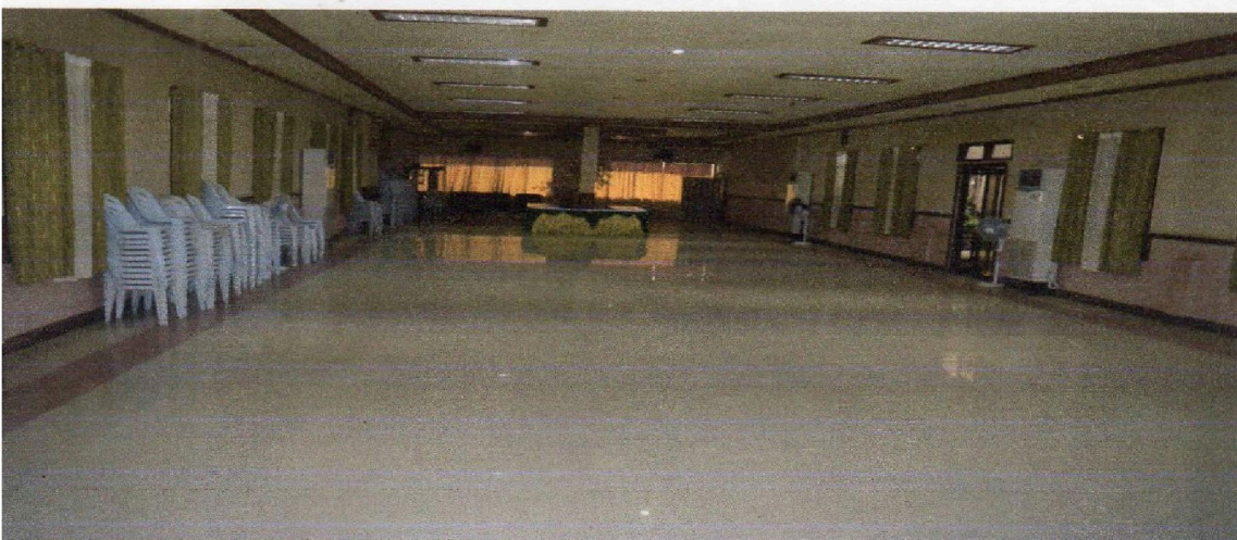
CLEAN AND SPACIOUS FLOORING