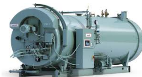
Figure 1. Image description (Times New Roman 10 pt, Sentence case)

If an image is displayed, it should use a minimum image quality of 300 dpi (dots per inch) to be clearly visible. The image is placed in the centre ( centre text ) and given a description underneath using Times New Roman 10 pt as in Figure 1. The image's title is written in bold ( Figure 1. .... ). Figure explanation is also written in the narrative. Figure numbering must be in order starting from Figure 1, Figure 2, etc; not Figure 1.1, Figure 2-4, etc. The distance between the figure and the figure caption with the paragraph before or after is 18 points, while the distance between the figure and the figure caption is 3 points.