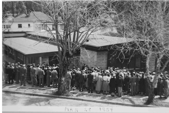
Dedication of the new hall

The construction started in October of 1953 and on March 28, 1954, stage one of the new hall was finished and it opened to the public.