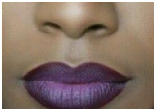
Lipstick inspiration photo