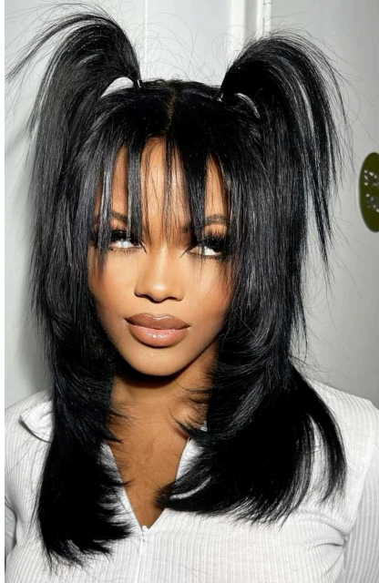
Hair inspiration photo