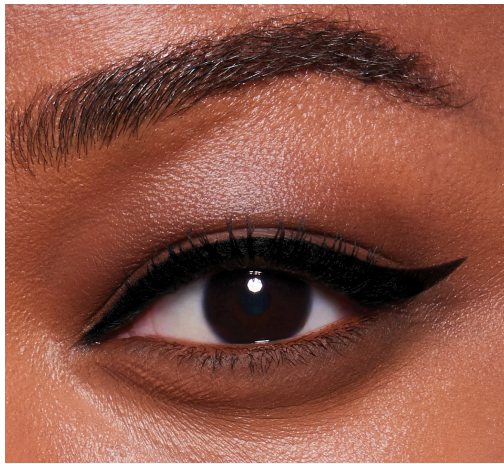
Eyeliner inspiration photo