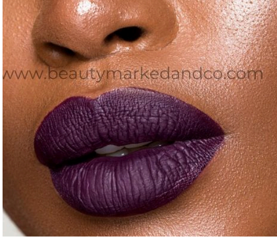
Lipstick inspiration photo