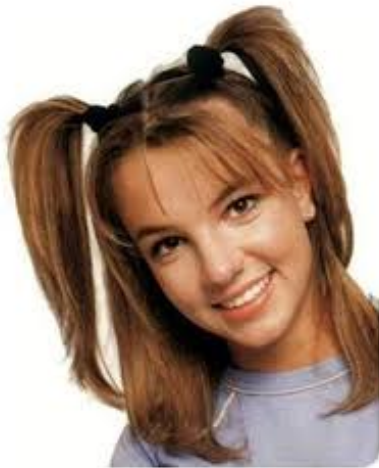
Hair inspiration photo