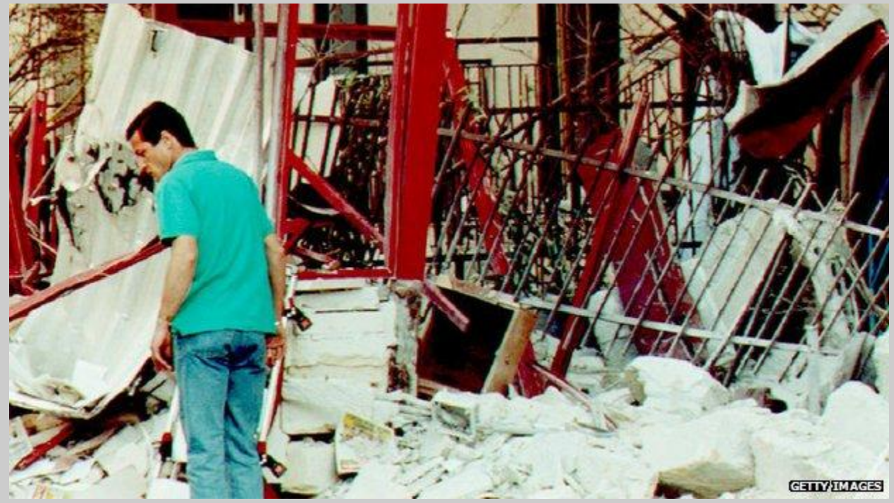
The aftermath of the "Banco Napoli Bombing"

<u>Attempted hit caught on camera - YouTube</u> (NSFW) Footage of the attempted murder of Salvatore Zannino