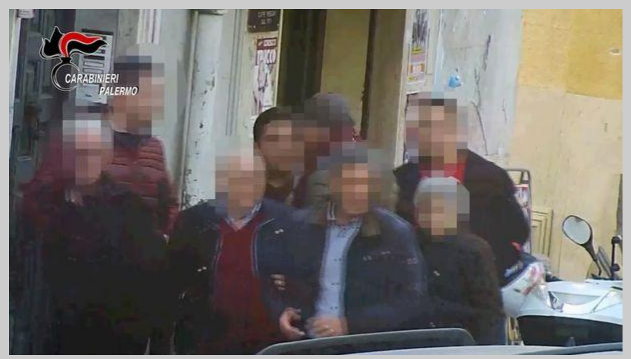
Carbineri surveillance of U.S Cosa Nostra members meeting with Sicillian big wigs.

Courtroom sketch of boss Salvatore Zannino in Palermo.