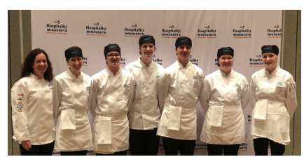
Elk River - 1st in Culinary