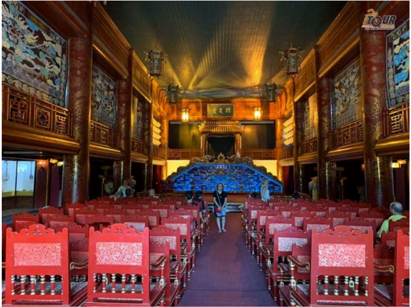
The majesty, solemnity, and sacredness here will impress you