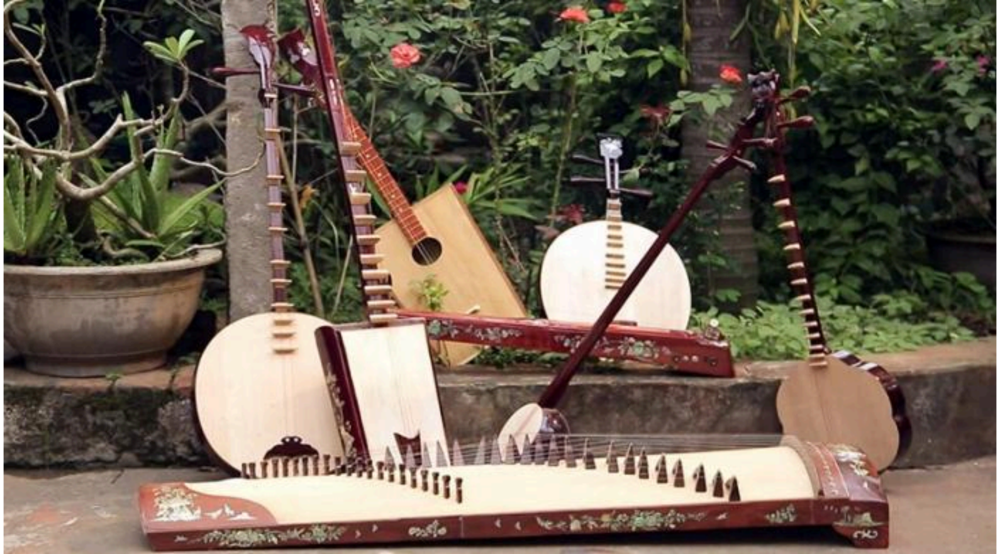
Instruments of Hue Royal Refined Music