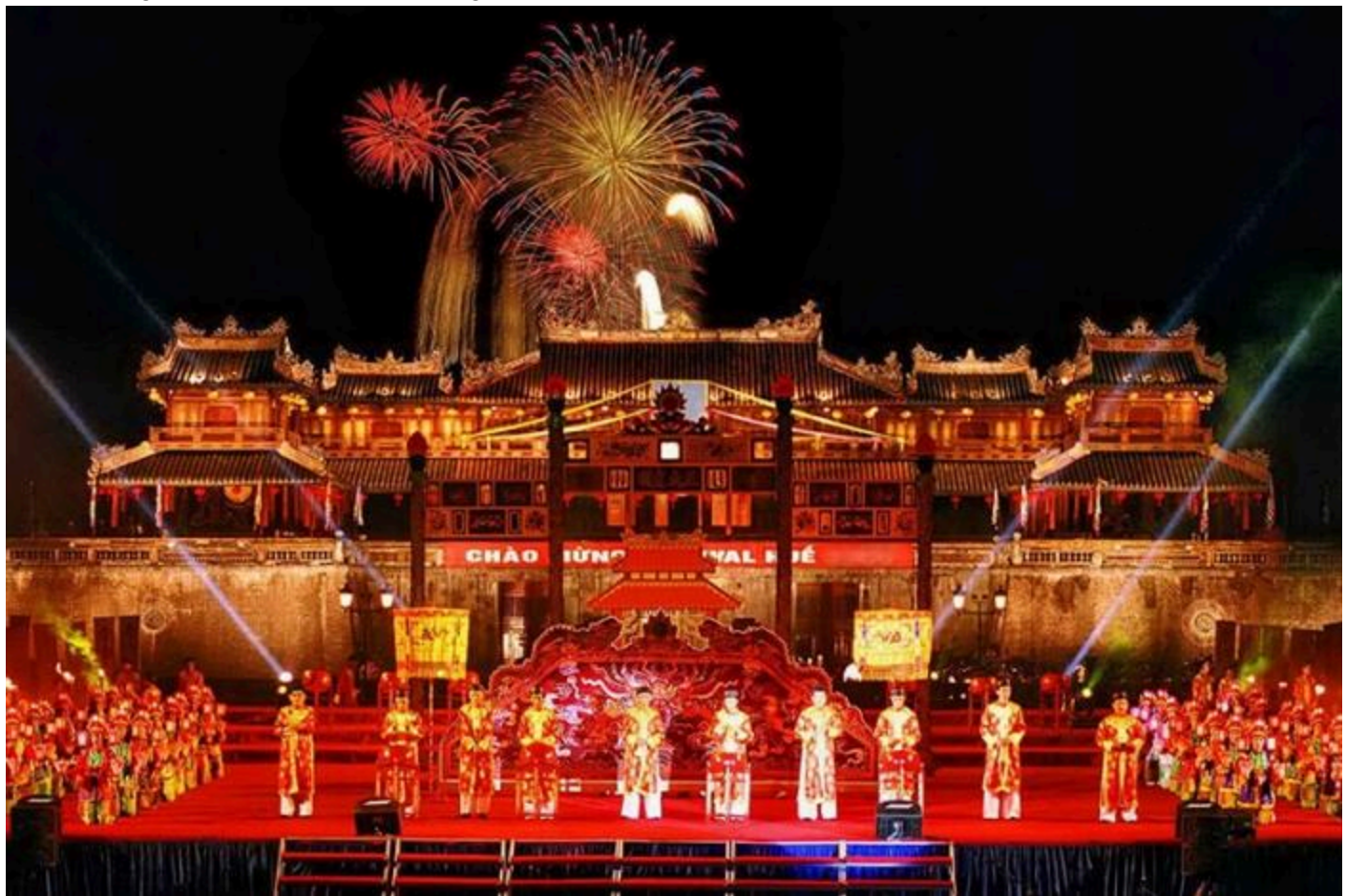
Hue Royal Refined Music is a crucial part of the Hue Festival

Back in the 19th century, this genre was considered the national music because it showed the royal dynasty's influence in every aspect of life. Interestingly, despite the word "royal" in its name, this genre was prevalent among both aristocrats and commoners.