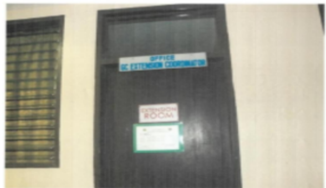
The GS Extension Office (2nd Floor, DD Clemente Building)