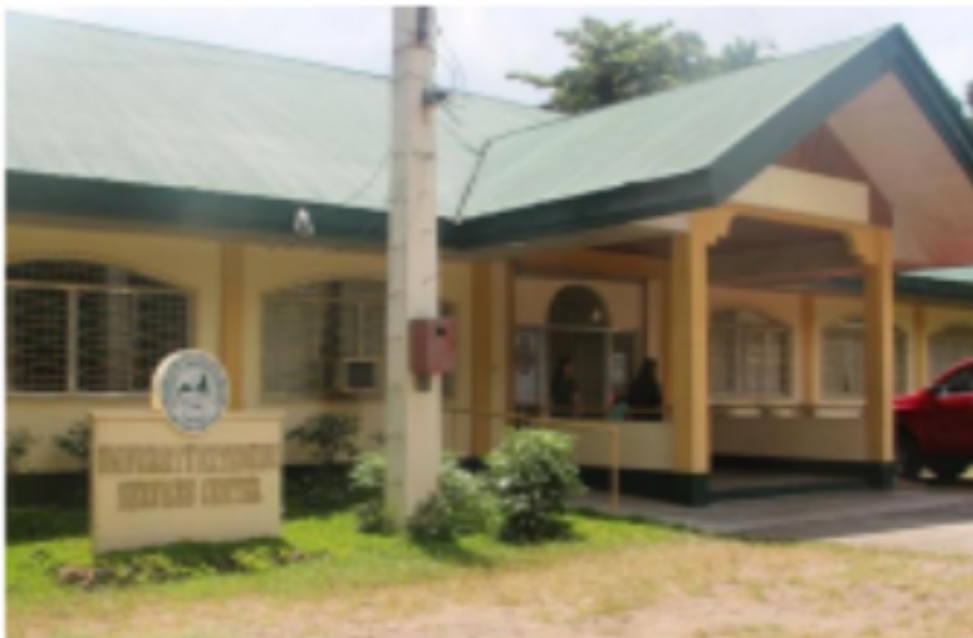
The University Extension Center

The university has a dedicated Extension Office that effectively manages and oversees the implementation of its extension programs, ensuring organized coordination, proper monitoring, and continuous community engagement initiatives. The Extension Services Office of the University of Southern Mindanao serves as a dedicated unit responsible for planning, coordinating, and implementing the university's extension programs. It functions as a central body that organizes community outreach initiatives, ensures alignment with institutional goals, and monitors the impact of services delivered to partner communities, thereby demonstrating that a distinct office effectively manages the Extension Program.