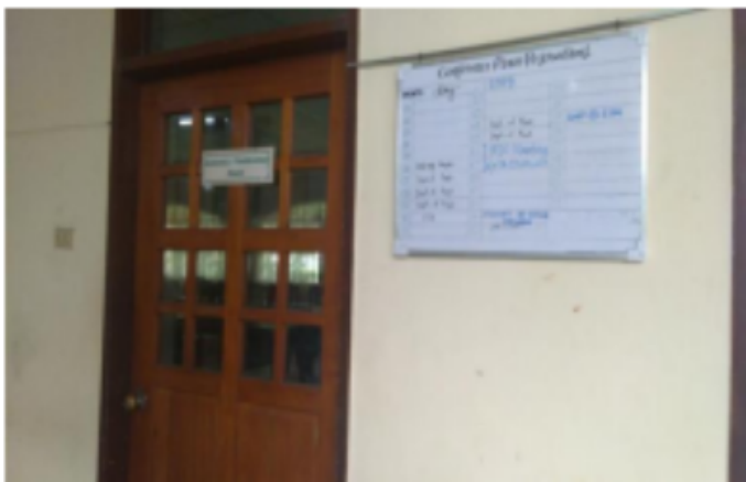
Extension Conference Hall