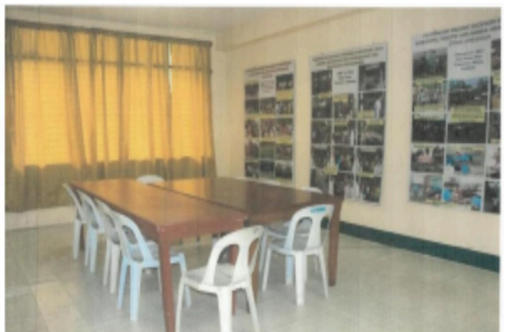
ESO Conference Room