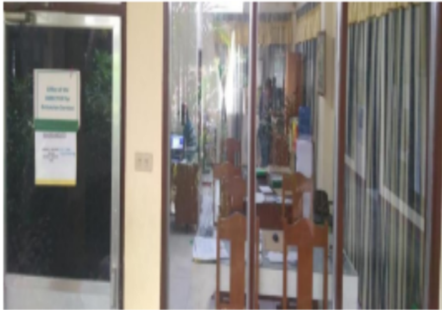
Office of the Extension Director