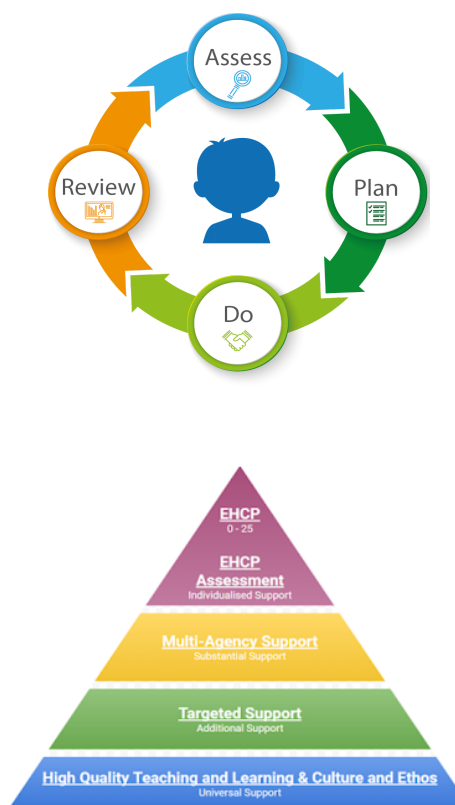
Figure 1. The graduated Approach

At this school, we consider the needs of the whole child and will continue to assess and monitor your child using the graduated approach (see below) and the four-part cycle of assess, plan, do, review. The class or subject teacher will work with the SENCO to carry out a clear analysis of the pupil's needs. The children's prior progress and attainment or behaviour is considered alongside the teacher's assessment and experience of the pupil. The pupils' views and the views and the experiences of the parents all form part of the cycle. Advice from external support services if relevant is sourced and the plans and subsequent assessments are reviewed regularly.