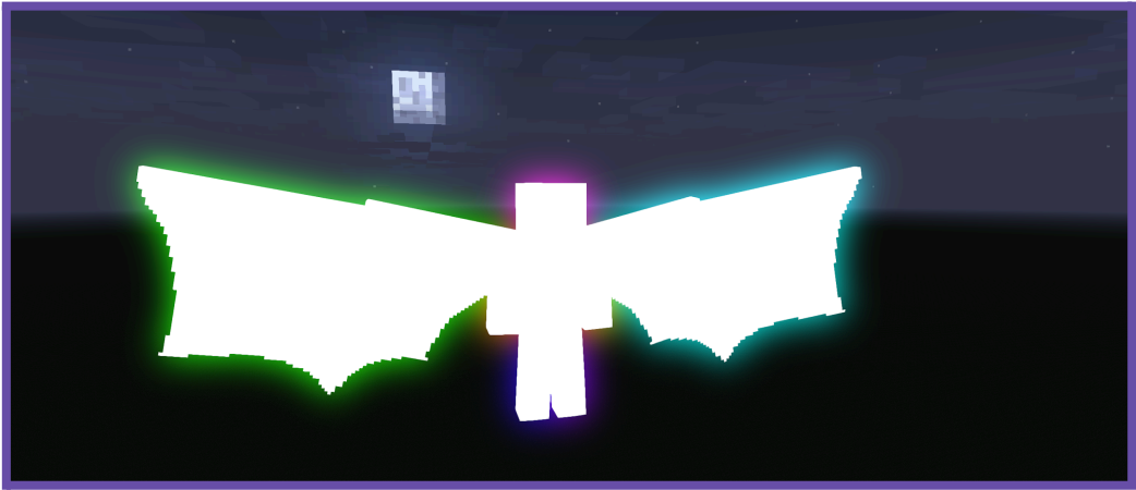
Instances of AML-590's currently form

Note: This is AML-590's current form as of now.