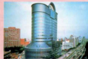
TOYOTA AUTO SALON AMLUX TOKYO

*The estimated time is based on the route indicated by the dotted line on the map.