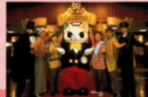
NAMCO NAMJA TOWN