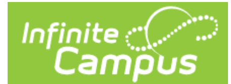
Infinite Campus Parent