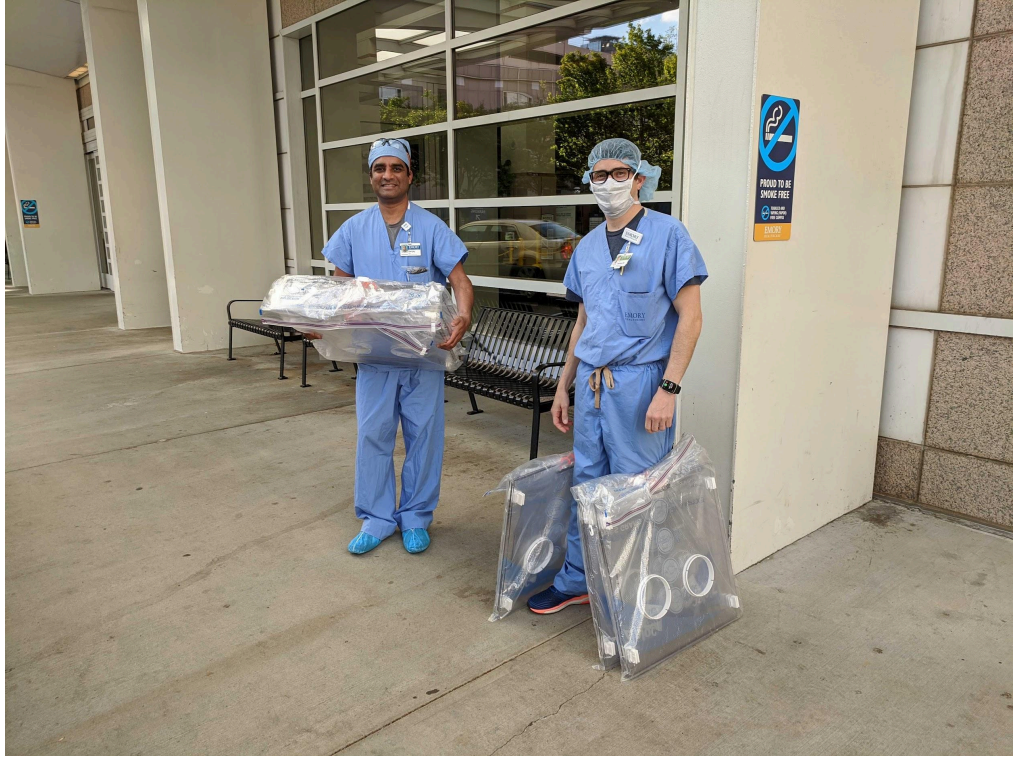
Emory Midtown Hospital Intubation Enclosures