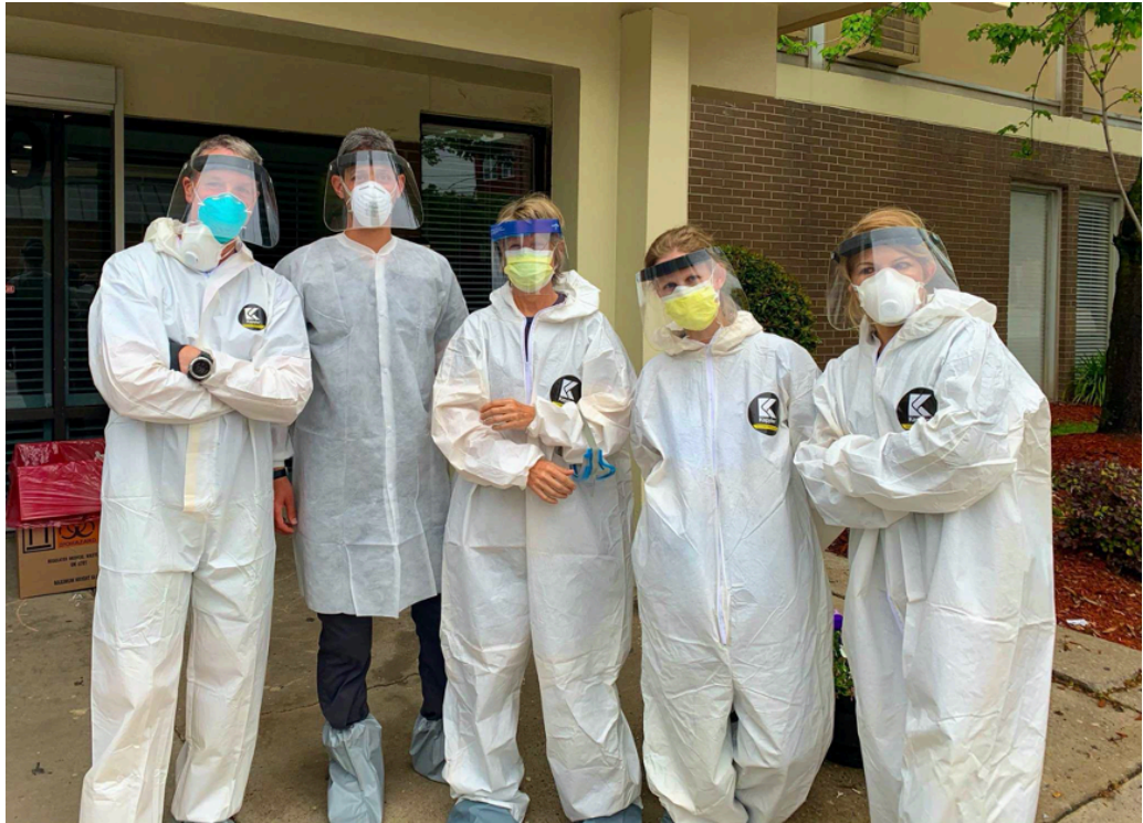
Fulton County Board of Health