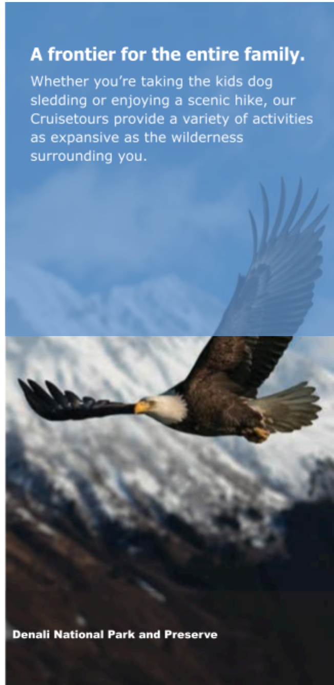
Denali National Park and Preserve

Whether you're taking the kids dog sledding or enjoying a scenic hike, our Cruisetours provide a variety of activities as expansive as the wilderness surrounding you.