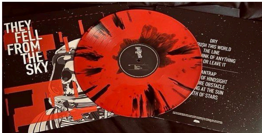
Figure 1. Explanation of the image (Source: Information on the source of the image) Cambria 11 pt, center

INTRODUCTION to CONCLUSION should be between 6-15 pages. The minimum requirement of number of references is between 30-60 references and 40-80 % taken from reputable international journals.