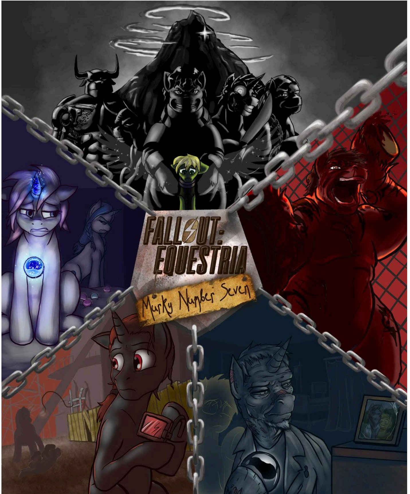
Cover Art by MisterMech