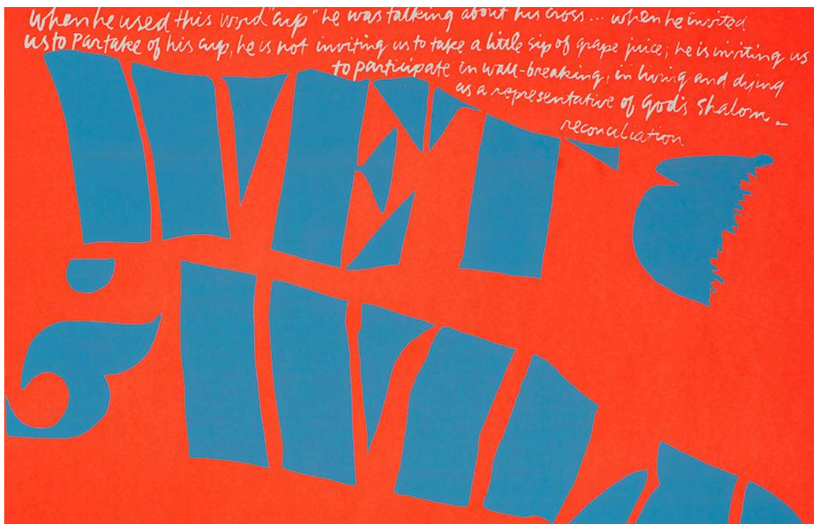
Sister Corita Kent, 1967