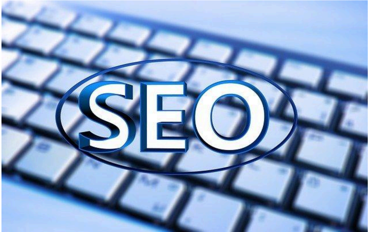
Figure out keyword(s) searchers will potentially type in the search box when looking for content.

Yes, optimizing your videos on the YouTube platform is the first step to promoting your content.