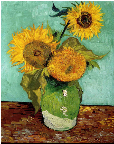
(Van Gogh, Sunflowers, 1887)