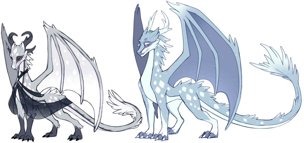
Concept art of Elurra's current design, along with her father Flurric