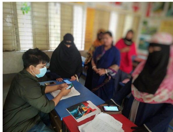
Digital literacy session with the Guardian Point on using Google Meet in April, 2021