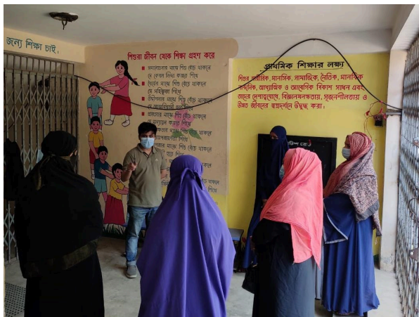
An emergency meeting with the Guardian Point after declaring the second phase lockdown in Bangladesh.