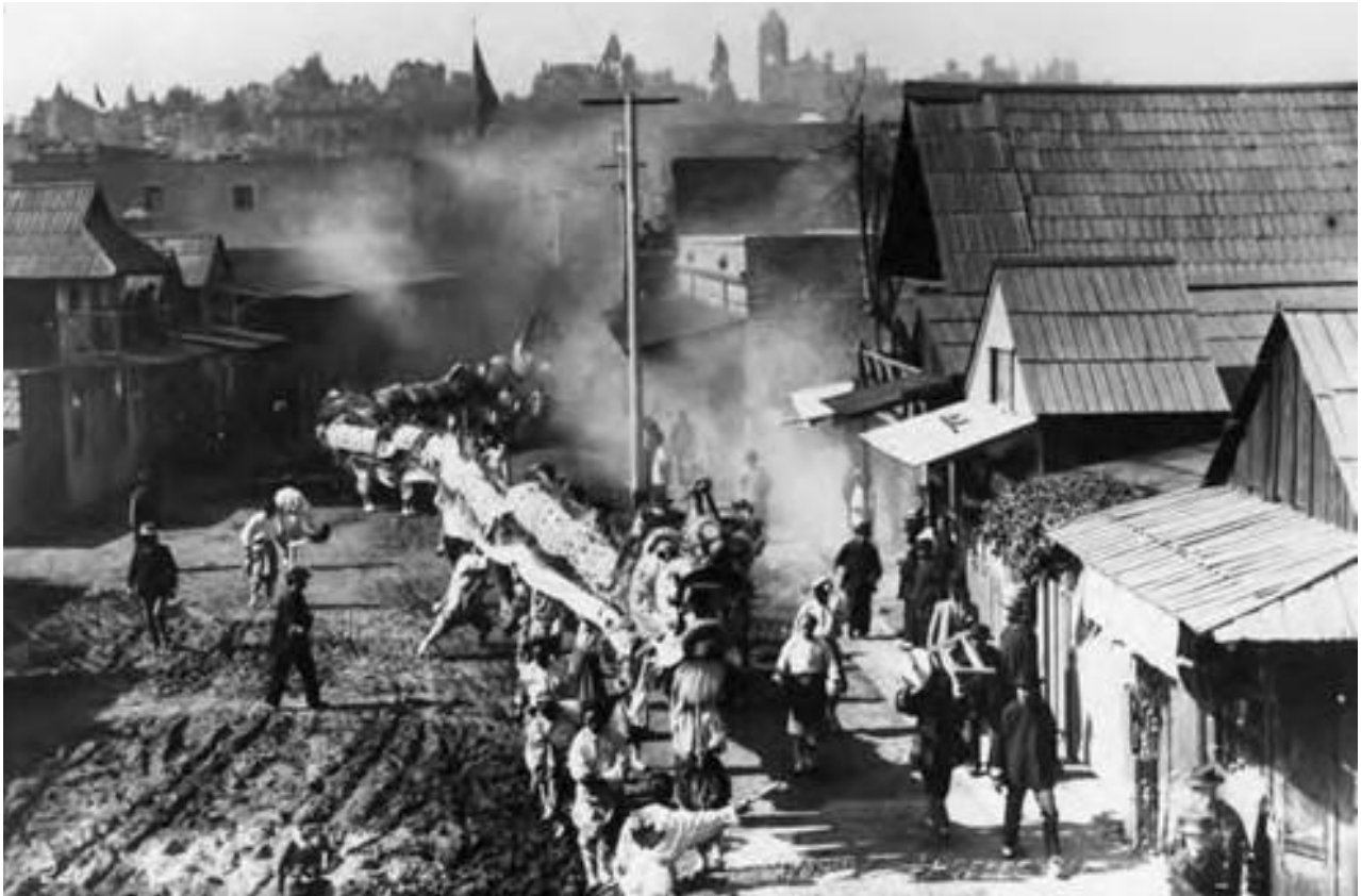
Dragon parade on Marchessault Street in the original Chinatown, 1885