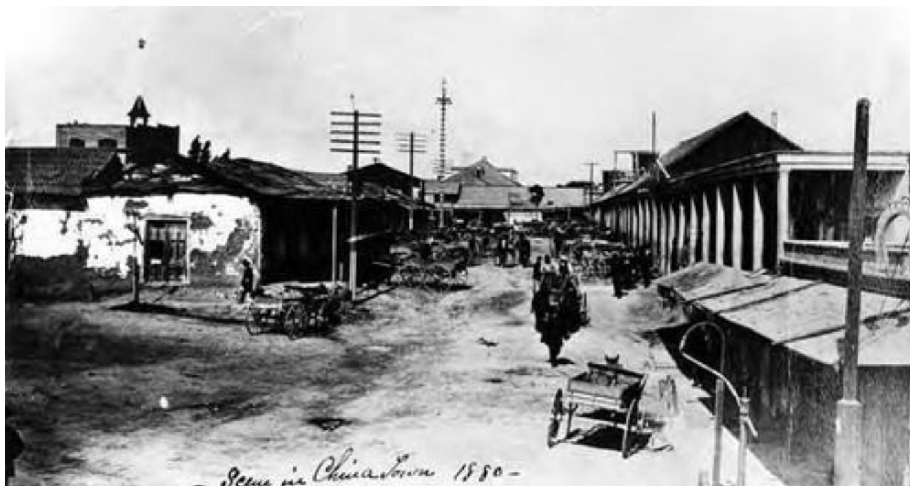
L.A. Chinatown, circa 1880: Calle de los Negros on the right. The Coronel Adobe, white building, on the left. This is the site where the Chinese Massacre of 1871 began.