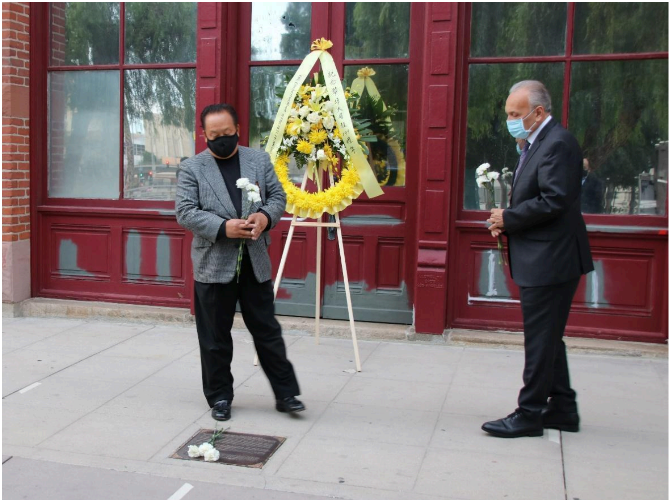
Commemoration Wreath with Chinese American Museum members laying flowers down on the 1871 Massacre plaque, outside the Chinese American Museum