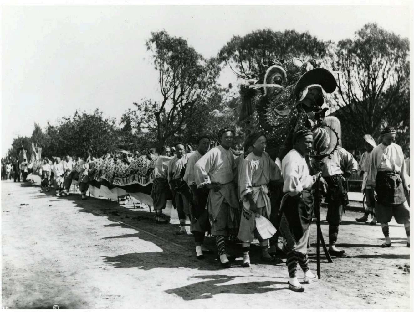
Chinese Dragon Procession