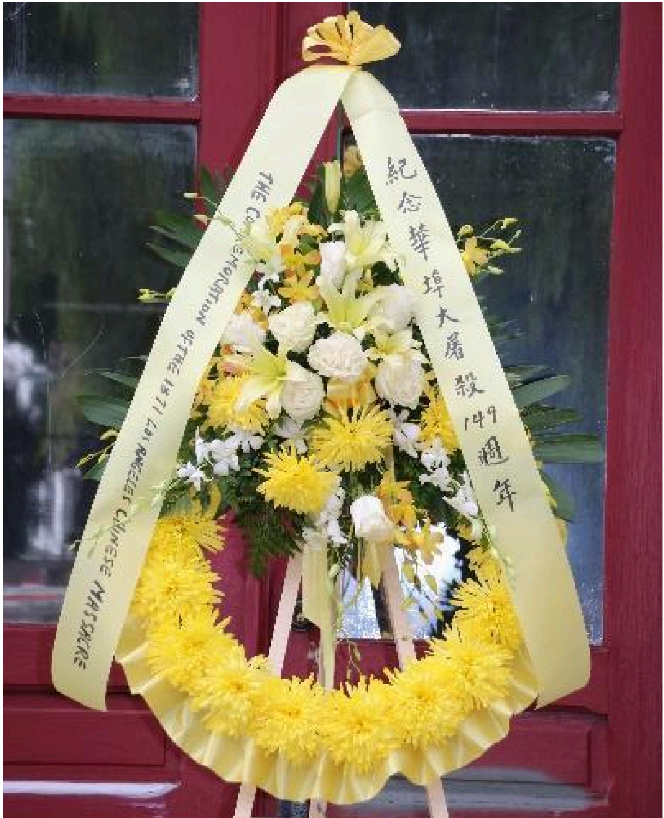
Commemoration Wreath at Chinese American Museum for the 150th Anniversary of the Chinese Massacre of 1871