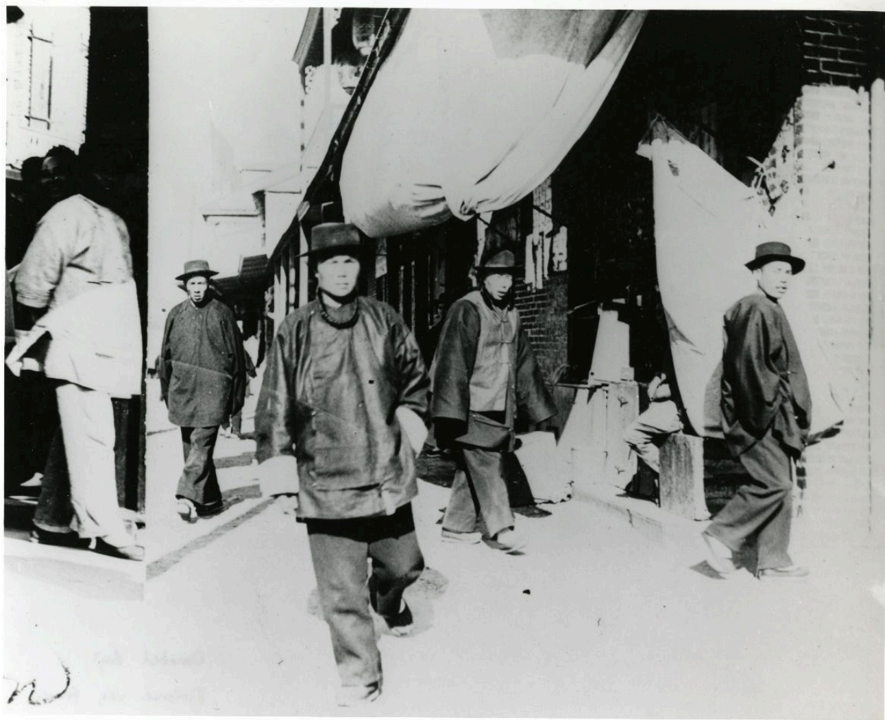
Men in Chinatown