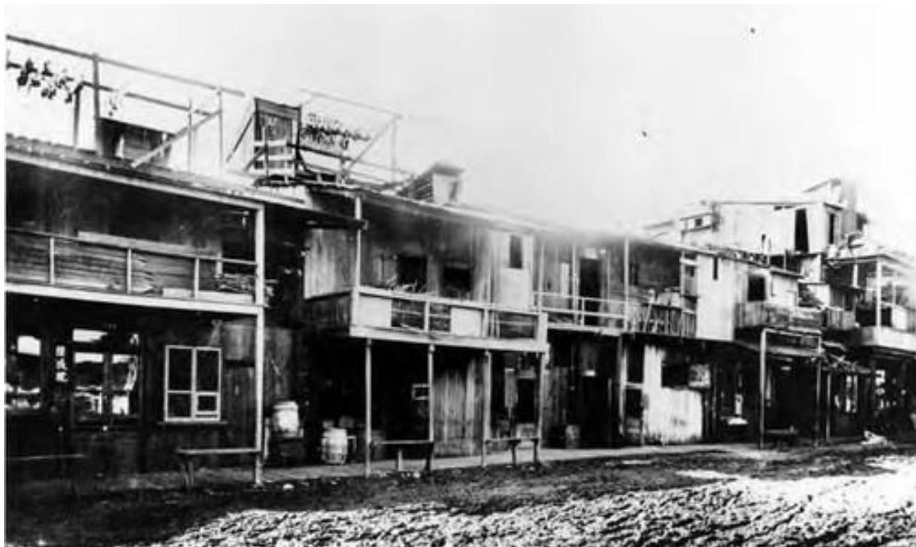
Original L.A. Chinatown, 1889