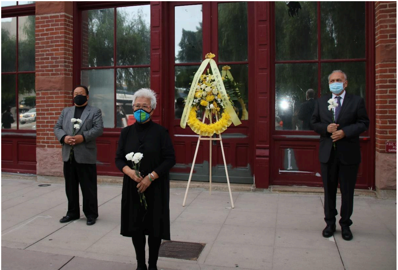
Commemoration Wreath outside the Chinese American Museum with museum members