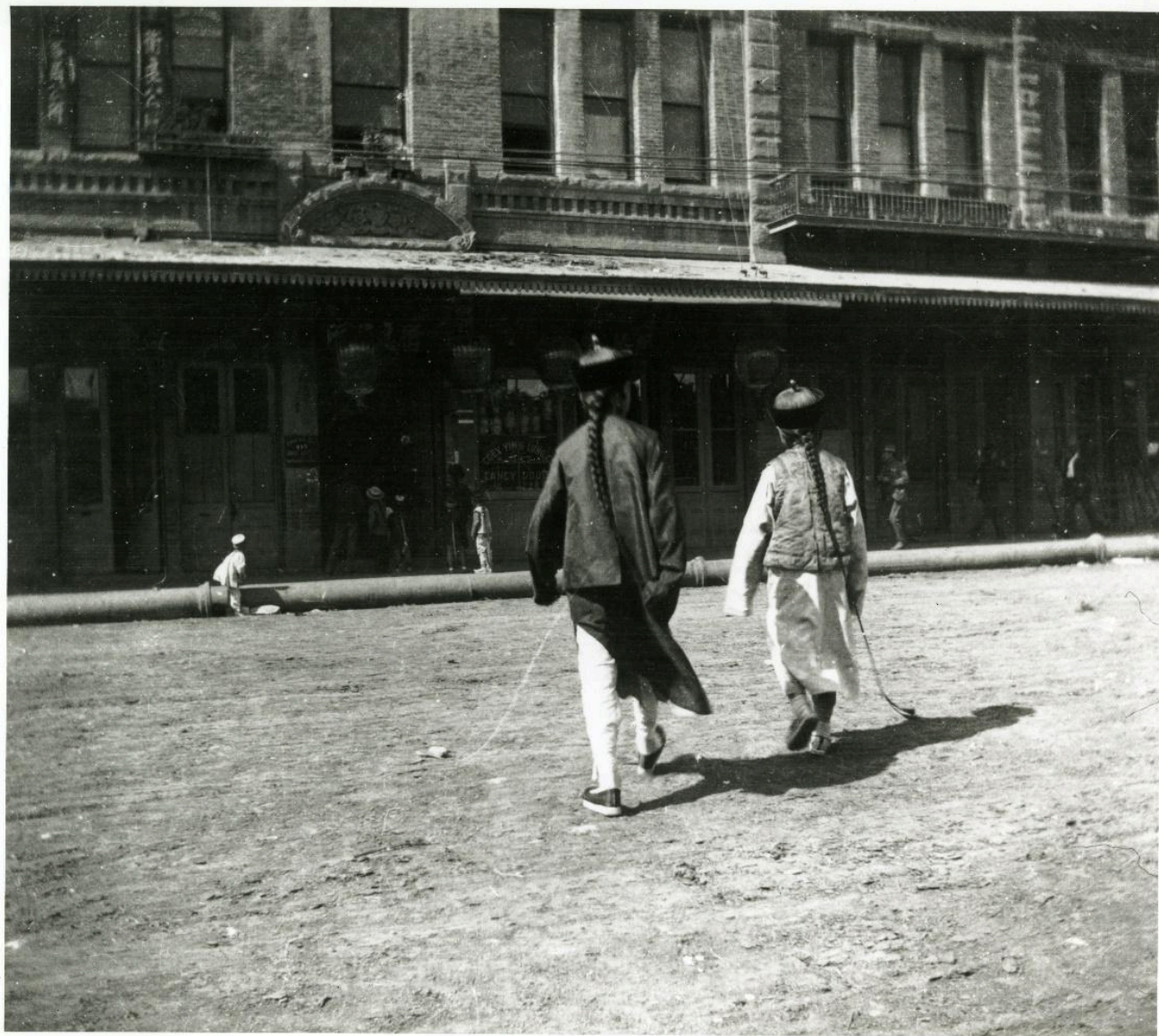
Two men in Chinatown