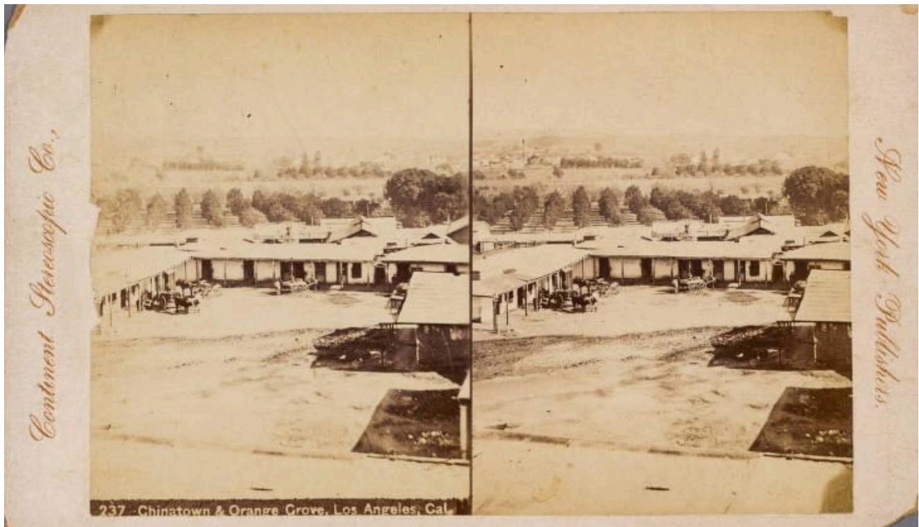
Chinatown and Orange Grove, Los Angeles in 1875