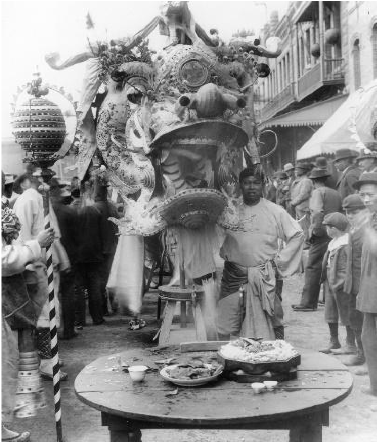
Chinese New Year Parade Dragon