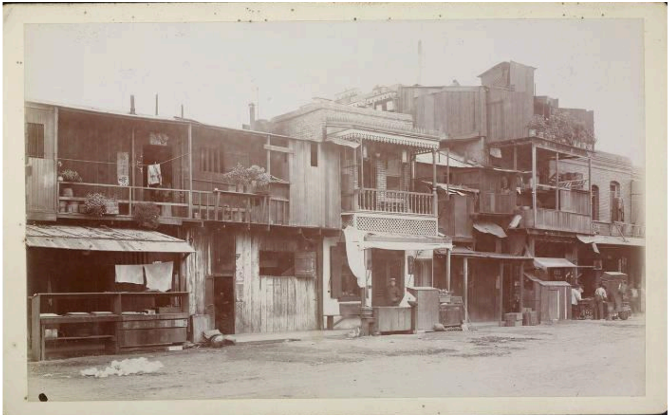
Street View of Old Chinatown, 1888