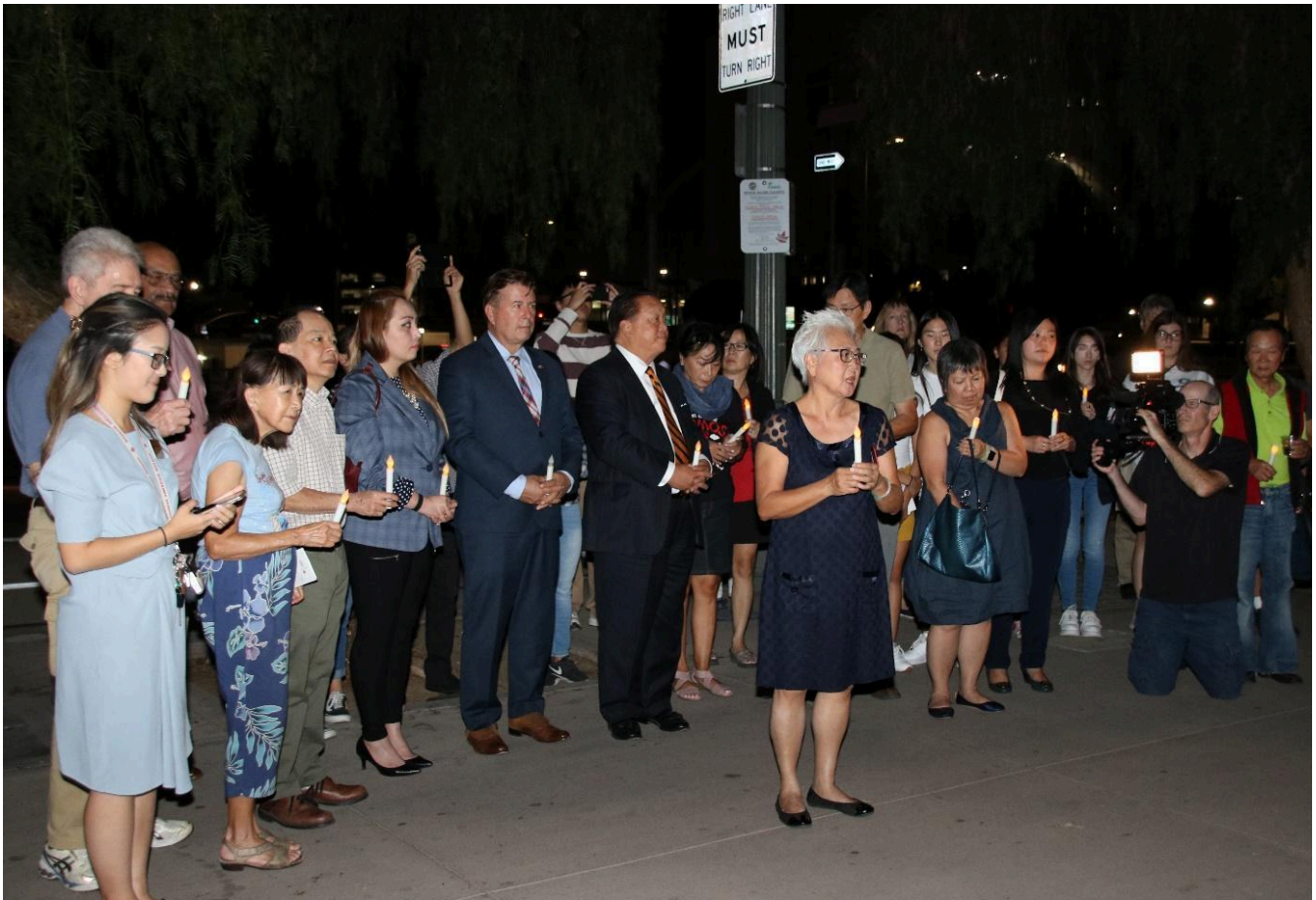
Candlelight Vigil at Chinese American Museum, 2021