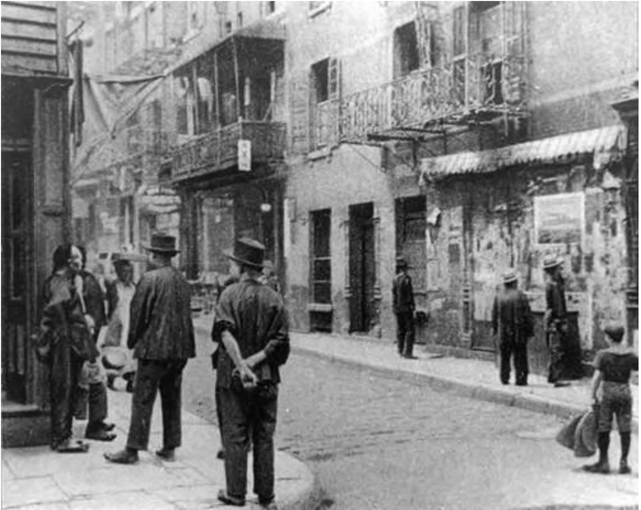
Street filled with Chinese merchants, circa 1880