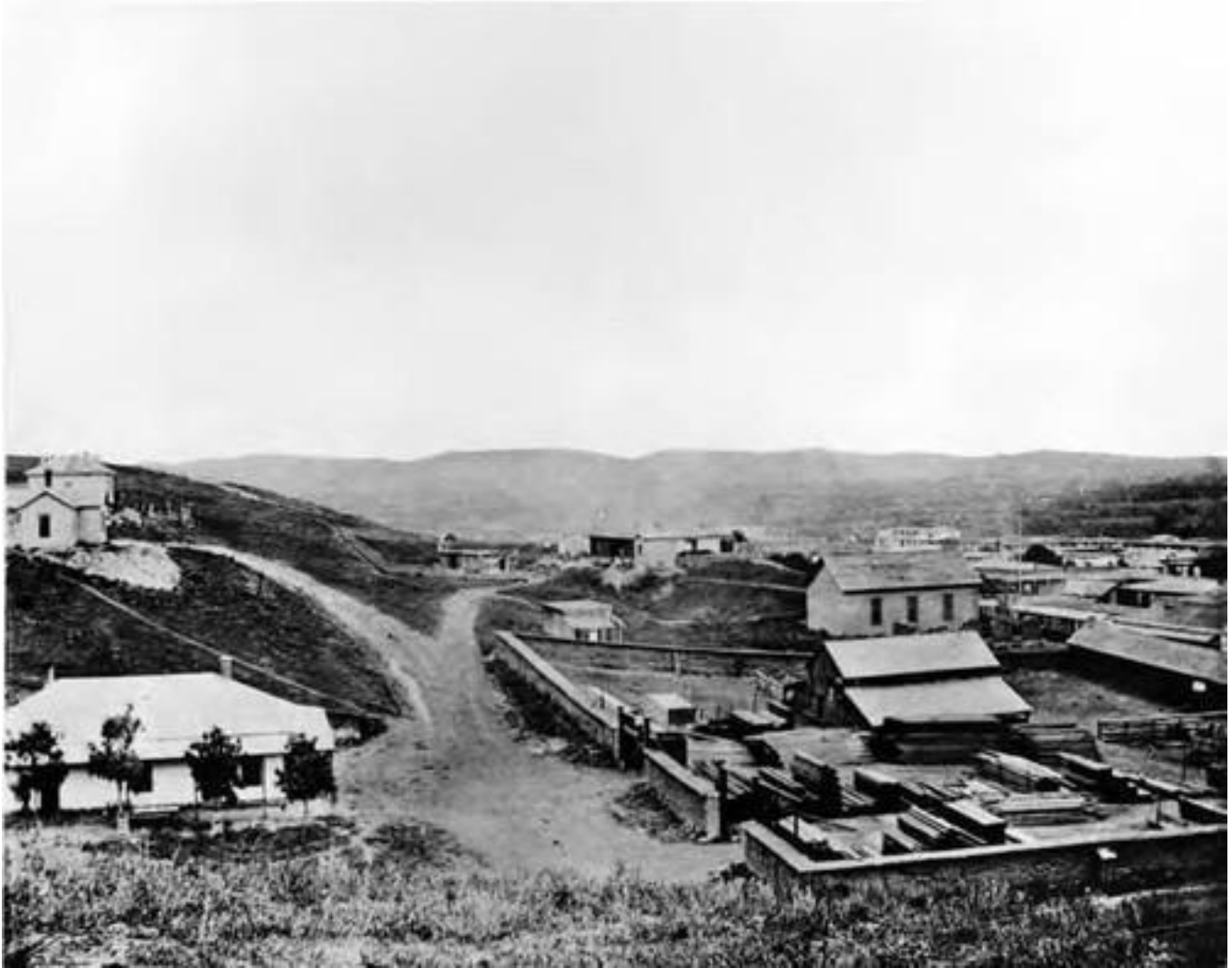
A view from Commercial Street and Spring Street, looking north to the Plaza, 1869. The lumber yard on the right is where the Chinese Massacre of 1871 took place.