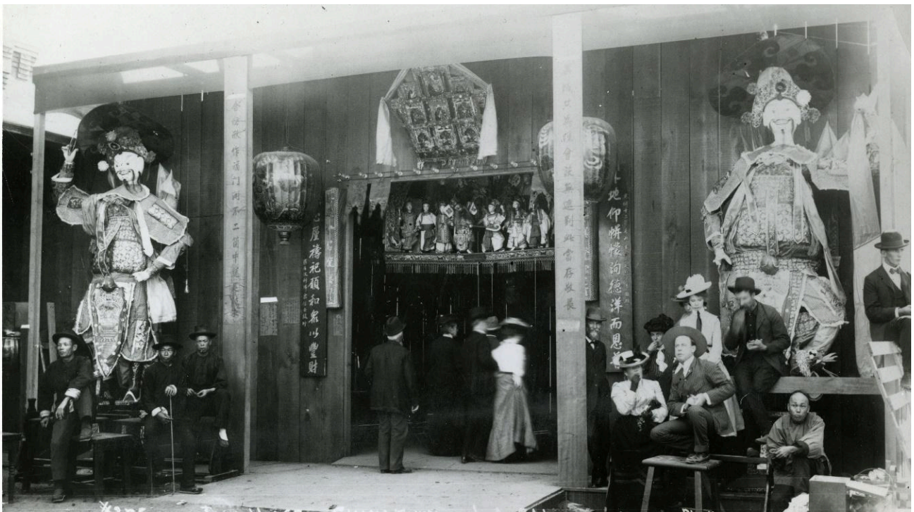
Joss House in Chinatown