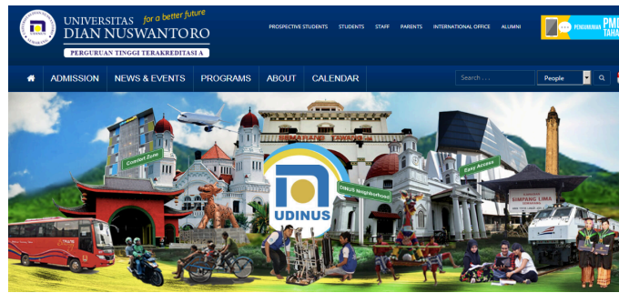
Figure 1 Figure Caption [Source]. Use Figure Style for automatic figure numbering

Last Name, F.N. & Last Name, F.N, (2021). Title of Article. STRUKTURAL (Seminar on Translation, Applied Linguistics, Literature, and Cultural Studies) . 3 (02), 1–20. (by editor)