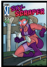
Huge Form: Drop Stealth for fitness d8. Vitality becomes d6, Gains strength at d10, loses gadgets.