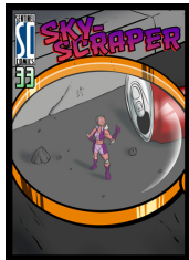
Tiny Form: (Requires Yellow Zone) intuition becomes d10, Gadgets becomes d8, Technology becomes d8, Persuasion becomes d6, stealth becomes d10, close combat becomes d8