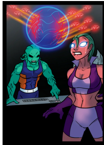
“Alien Education” form: (Any Size), Gadgets becomes d10, Vitality becomes d6, Technology becomes d10, Close Combat becomes d6, Drop Stealth for Science at d8