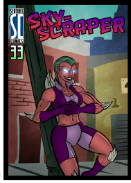
Base Form (As above)