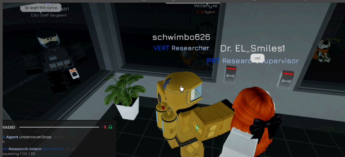
Karma happening when the Crimson-9, the CSU, and Panda get stuck