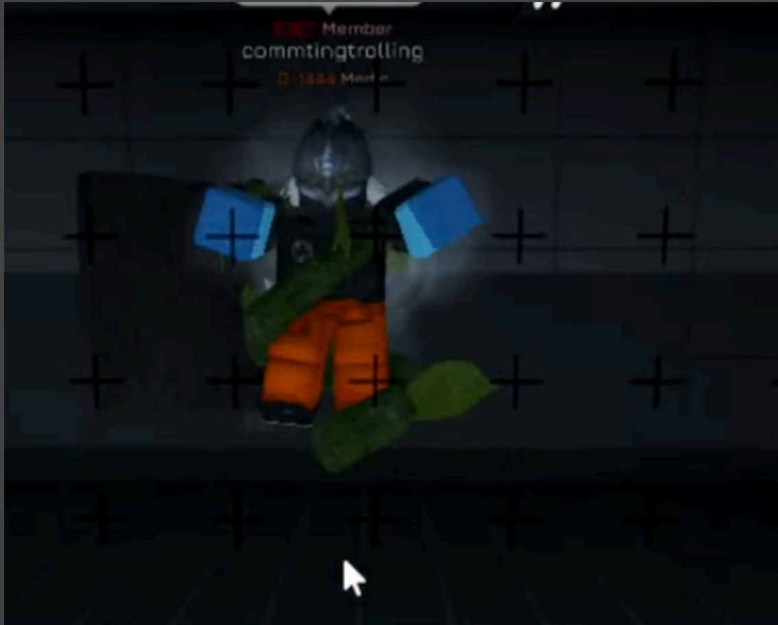
The first Class-D in vines