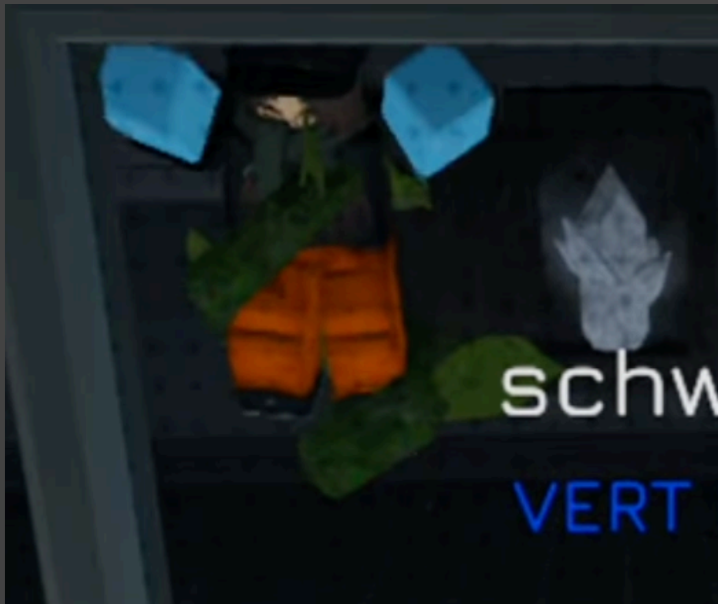
The second Class-D in the vines