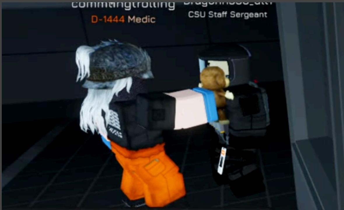
The First Class-D inside the inner chamber