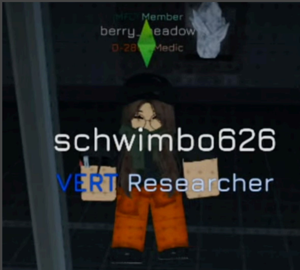
The second Class-D inside the inner chamber