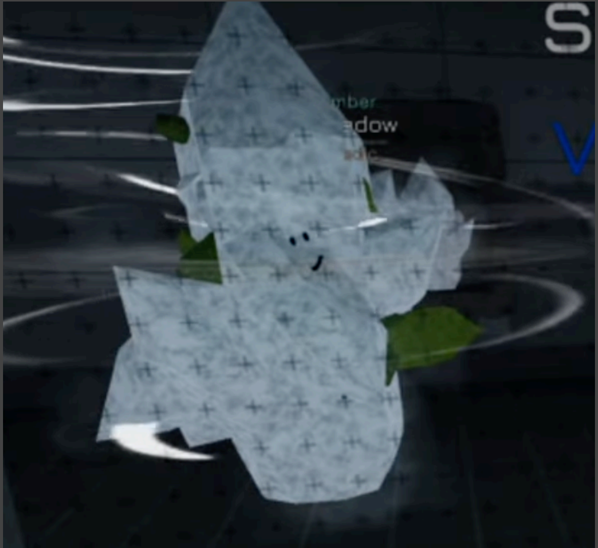
The crystal with the vines on it