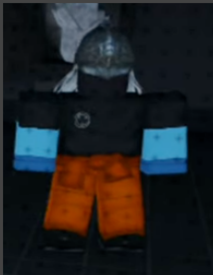
The Class-D after being infected