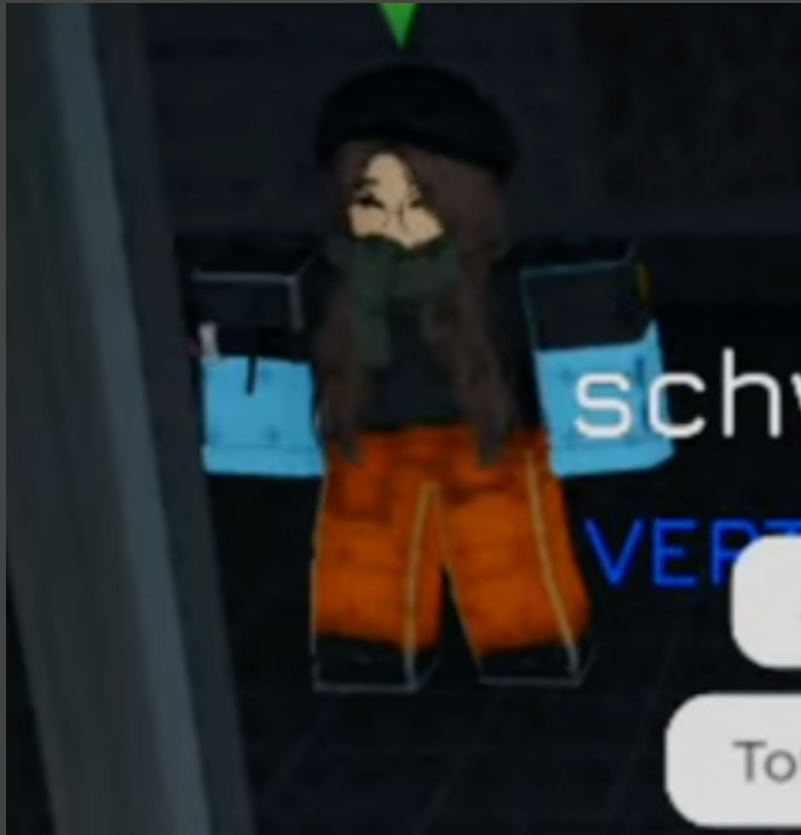
The second Class-D infected