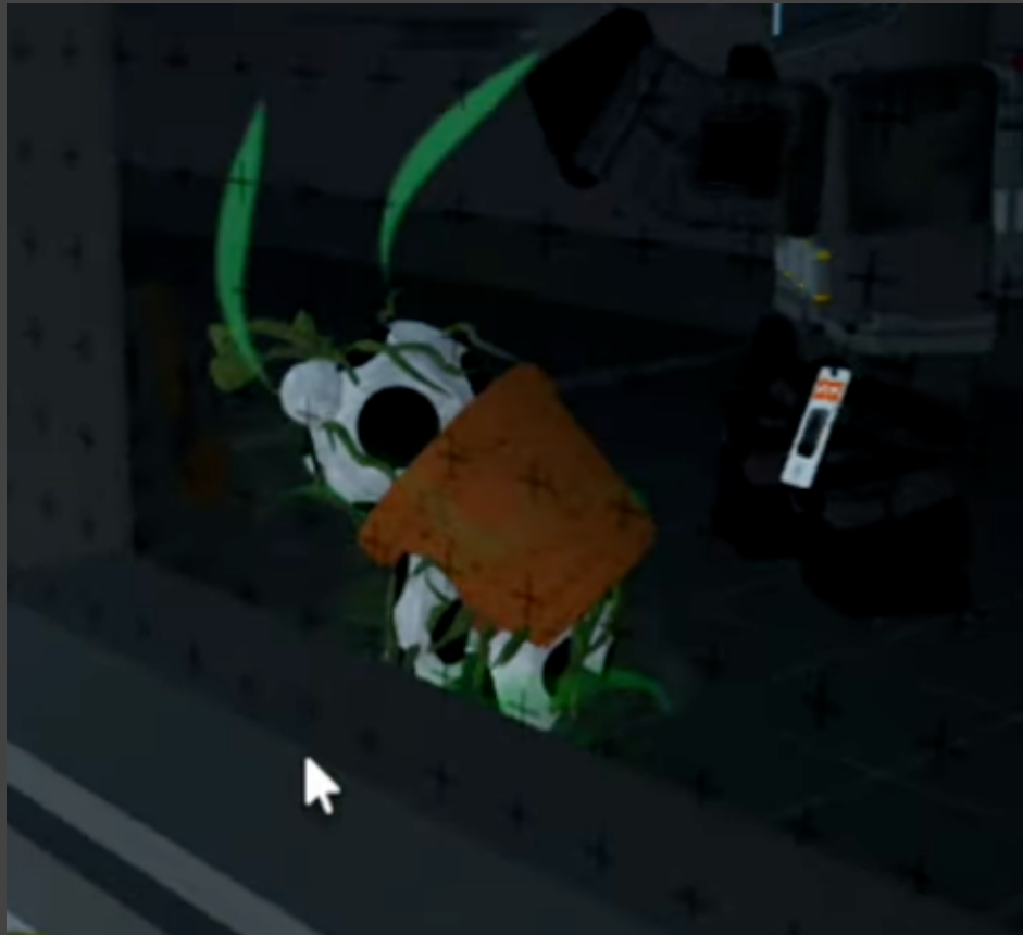
Panda using his powers