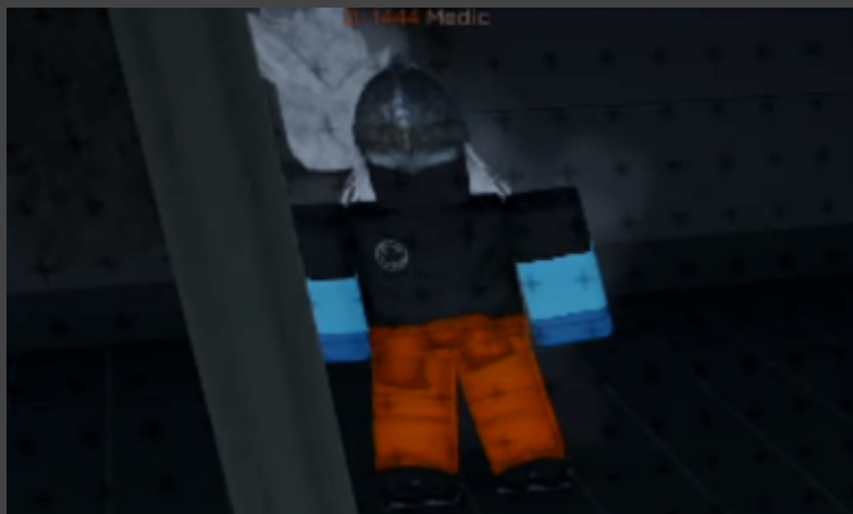
The Class-D after getting out of the vines