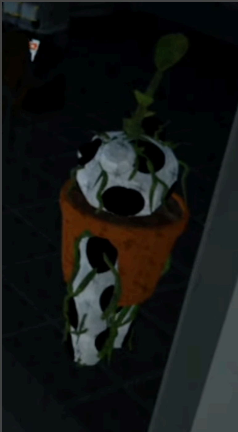
Panda inside the inner chamber again