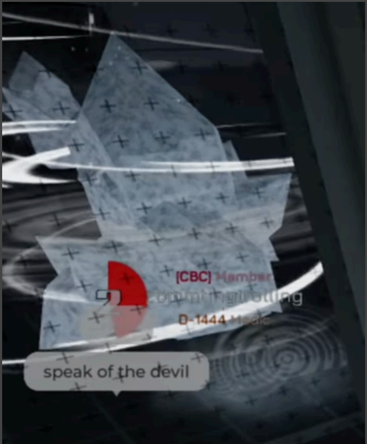
The Class-D crystallizing