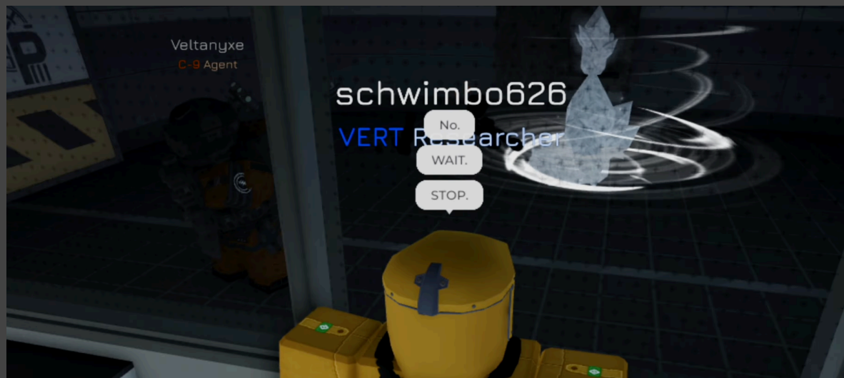
The Crimson-9 and the CSU shooting the crystal while I am telling them to stop