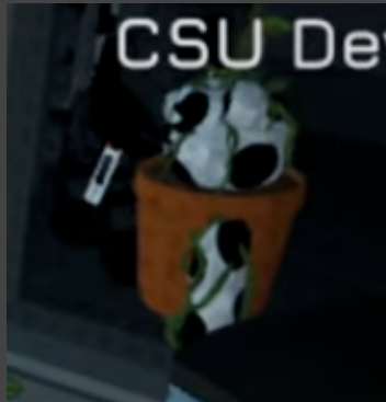
Panda inside the chamber