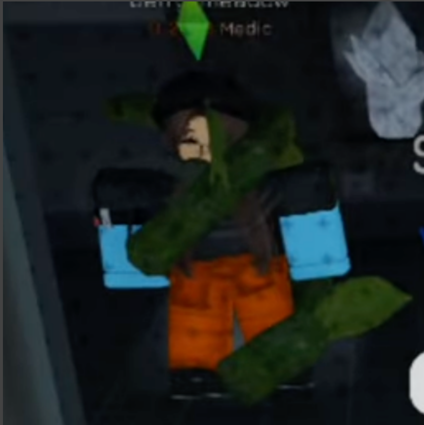
The second Class-D in the vines in stage 2