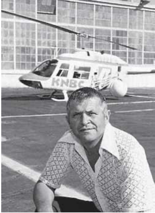
Accident: August 1, 1977 (faulty fuel guage)

"A myriad of men are born; they labor and sweat and struggle...they squabble and scold and fight; they scramble for little mean advantages over each other; age creeps upon them; infirmities follow; ...those they love are taken from them, and the joy of life is turned to aching grief. It (the release) comes at last -- the only unpoisoned gift earth ever had for them -- and they vanish from a world where they were of no consequence, a world which will lament them a day and forget them forever." MARK TWAIN SHORTLY BEFORE HIS DEATH