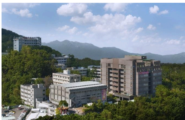
臺北校區 Taipei Campus