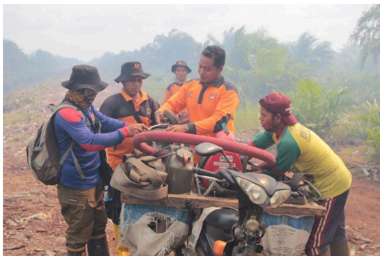
Figure 1 (title) [Times New Roman, 11 pt, normal]

[Times New Roman, 10 pt, normal]