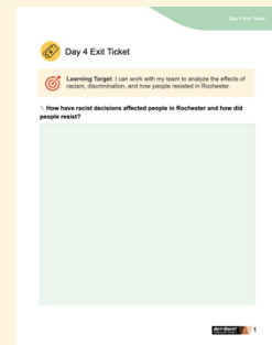
Day 4 Exit Ticket