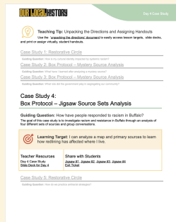
Day 4 Case Study