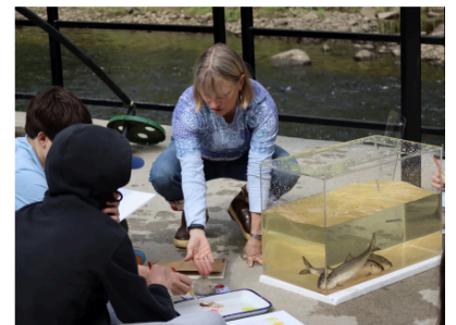
Eighth Graders at Work