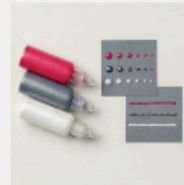
Pearlized Enamel Effects Basics [156310] $15.00