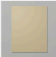
Crumb Cake 8-1/2" X 11" Cardstock [120953] $9.25