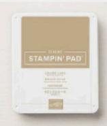
Crumb Cake Classic Stampin' Pad [147116] $8.00