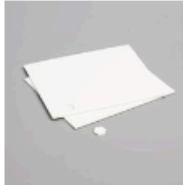
Stampin' Dimensionals [104430] $4.25