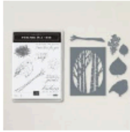
Perched In A Tree Bundle (English) [159799] $53.00