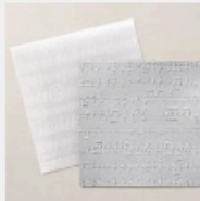
Merry Melody 3 D Embossing Folder [156392] $10.00