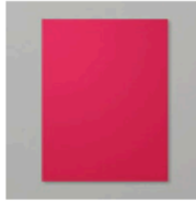
Real Red 8-1/2" X 11" Cardstock [102482] $9.25