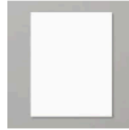
Basic White 8 1/2" X 11" Cardstock [159276] $10.25