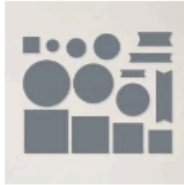
Stylish Shapes Dies [159183] $30.00