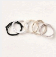
Baker's Twine Essentials Pack [155475] $11.00