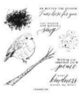
Perched In A Tree Cling Stamp Set (English) [159791] $23.00