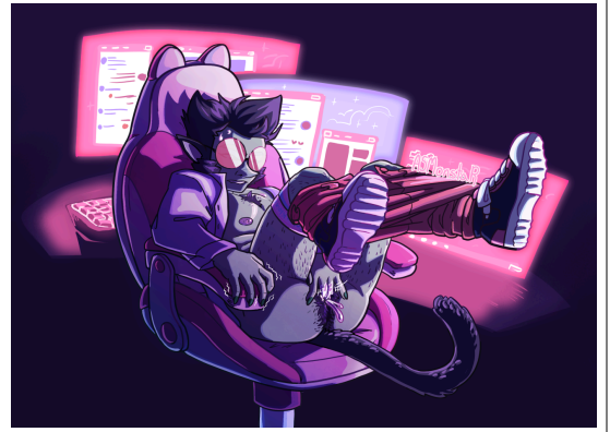
Two Character - Full body - simple color (no background/abstract)