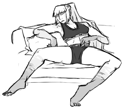
Single Character - Fully body - Sketch