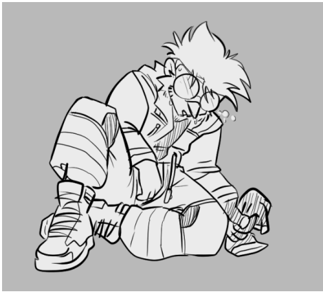
Two character - simple color- no background (Between bust and fullbody)