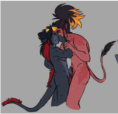
Two character - full body - detailed color (soft shading. Colored lines) Abstract background