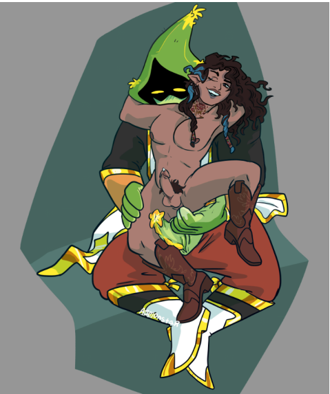
Sketch - single character - simple color Messier option, this would be priced between sketch and color