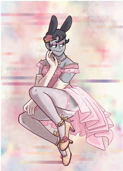
Sketch two characters 'bust' (half characters) - colored Would split difference the price between sketch and simple color