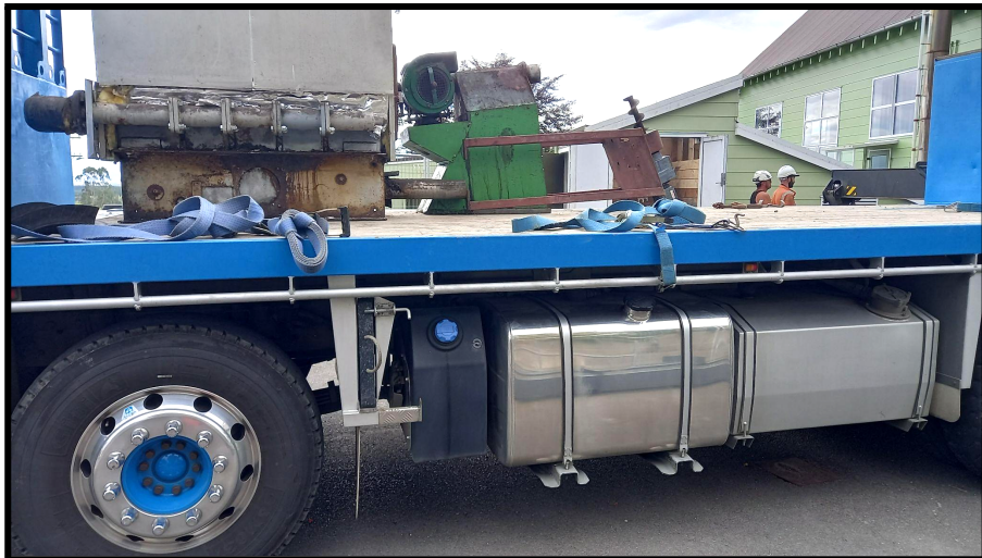
On the back of the truck the boiler and auger. Hanging on the end of the crane is the old coal hopper.