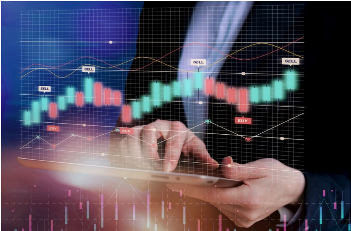
Alt: Hands holding a tablet showing stock market buy and sell signals.

A DEX Screener tool can significantly enhance your decentralized exchange (DEX) trading strategy by offering a range of benefits: