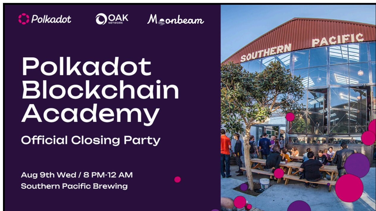
Polkadot Blockchain Academy closing party