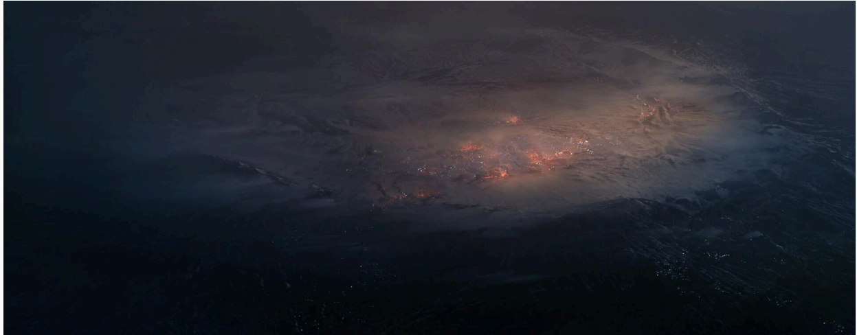
An early view of the settlements of present-day New Alexandria in the Margaritifer Crater.