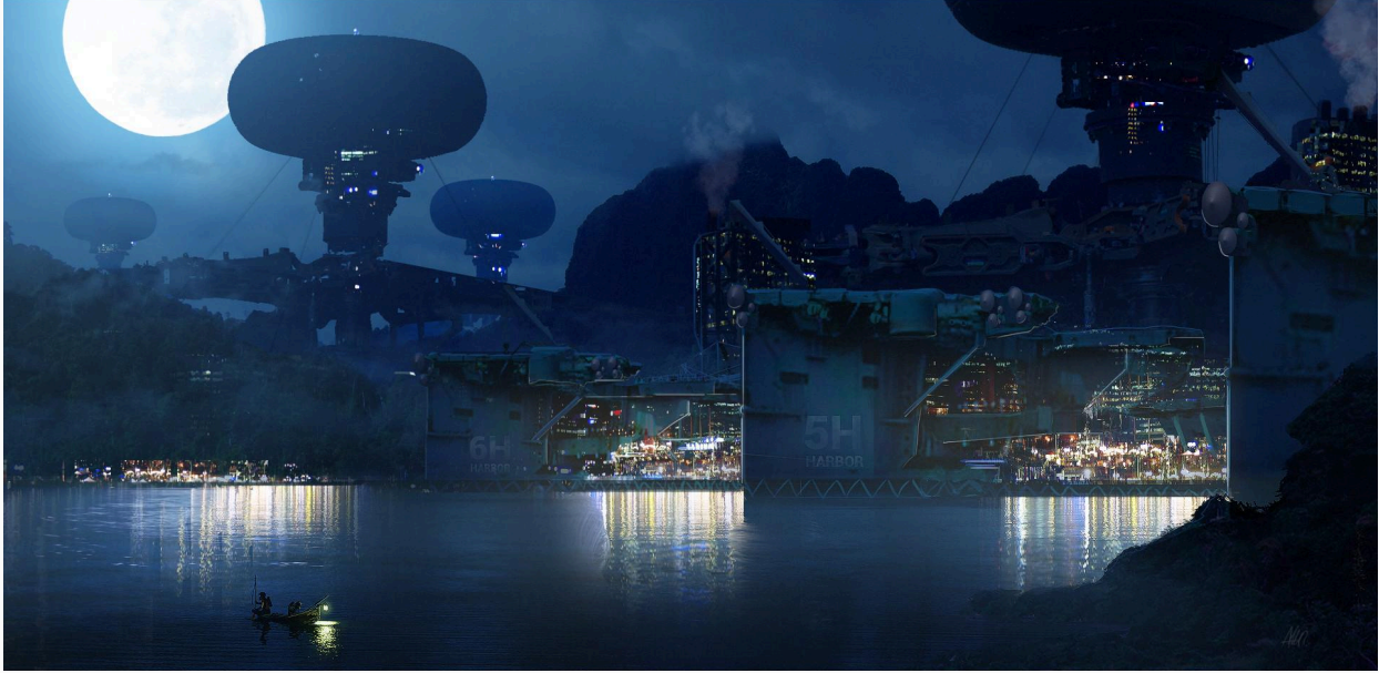
New Alexandria is populated by multiple industrial, logistical, and leisure ports through the waters of the city, including the picture Lower North Strargip port.

The majority of the city's economy therefore relies on trade and logistics, acting as a cheap hub away from the Capital but still linked to the rest of the planet in a central location. Trading companies, logistics districts, shipping, and trucking dominate the city's economy and politics. The Order, however, largely stays away from interfering in the trading and shipping itself, even with some of the larger logistics companies involved in the city, out of fear of harming the city's primary source of revenue and importance. Shipping companies are therefore mainly Order-backed businesses and are allowed to more directly influence aspects of the city, particularly local district-level power.