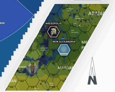
A brief overview of the city of New Alexandria, its divisions and districts, and its general location.