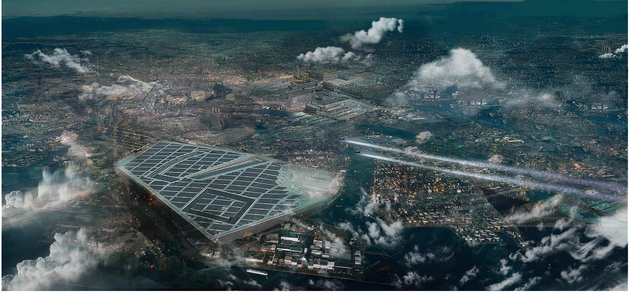
An overview of the city's southern districts.

Now, with the foundation of the Empire of Man, or simply 'the Imperium,' the city's ruling echelons are coming to terms with a competing entity striving for their allegiance. Given the proximity of New Alexandria to the core of the Imperium, their contest is sure to be interesting.