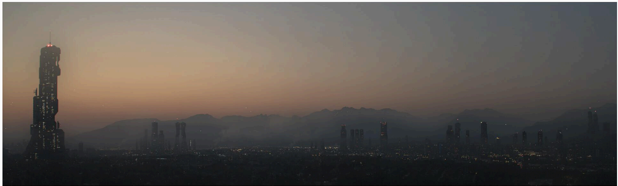
Panoramic view of New Alexandria's skyline from the Core, with the crater wall visible in the background along multiple housing towers.

Officially titled the Imperial City of New Alexandria, the city is built in an enormous crater stretching to the four corners of the survey area, punctured by a few bits of water at its sides. Part of the Protectorate of Xanthe-Noachis, the city sits just a stone's throw away from Aresopolis and New Lagos, on the edge of the Meridian Plain and Margaritifer's crossing. The wide New Indus River passes through it, connecting the upper Chryse Gulf and Aram Bay to the city's Amotmilqart Bay and Alexander's Bay.