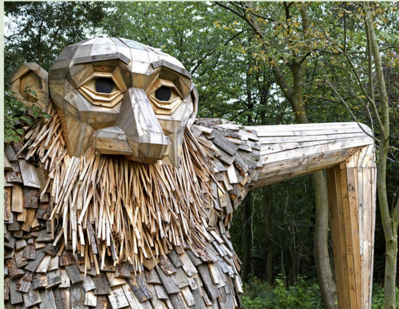
Danish Artist Thomas Dambo's Troll Sculptures