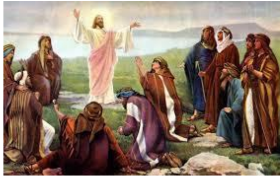
Figure 1. Jesus and disciples (Leunig, 1995, p. 24).